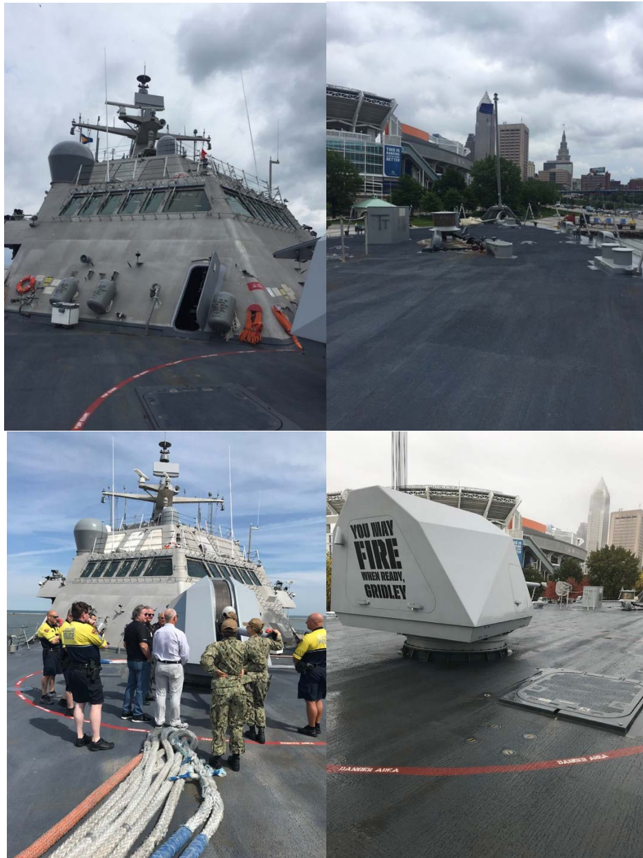
On board Pre-Commissioning Unit (PCU) BILLINGS (LCS 15), Apr 2019, and USS INDIANAPOLIS (LCS 17), Oct-Nov 2019

YMCA (as the ship's bathrooms are not available for normal use while underway on the Great Lakes), to co-host pier-side cookouts for the crews with the Cleveland Police Patrolmen's Association, and to offer ship tours to begin familiarizing Cleveland's corporate leaders with the ship class of which the future USS CLEVELAND will be a part.