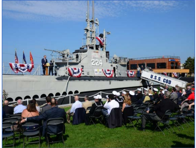
Public announcement in Cleveland, October 2018