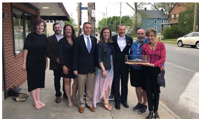
Volunteers after team dinner, Ohio City

In 2019, the organization hosted the first pair of several anticipated visits by sister Freedom-variant littoral combat ships transiting from the shipyard in Wisconsin to homeport in Florida. Pre-commissioning unit (PCU) BILLINGS (LCS 15) and USS INDIANAPOLIS (LCS 17) made visits to the Port of Cleveland in April and October, respectively, to take on fuel, which allowed the USSCLF team to coordinate access to the gym and showers at the Parker Hannifin Downtown