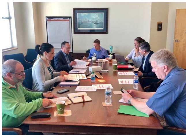
Working session, Great Lakes Science Center

In addition, the organization’s growing group of volunteers hosted a series of events, including a working session, a reception in honor of the Ship Sponsor, and a team-building dinner.