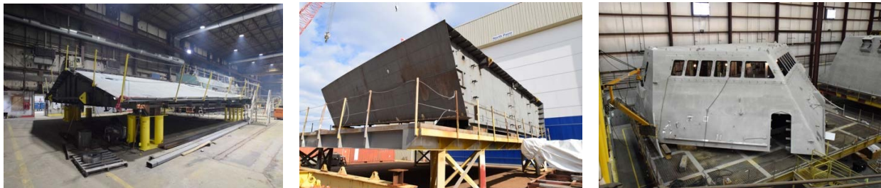
Modular construction of the future USS CLEVELAND (LCS 31)