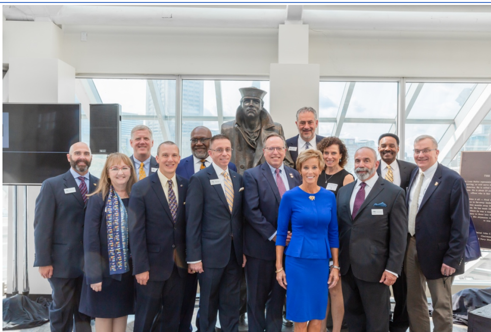
USS Cleveland Legacy Foundation team members celebrate the dedication of The Lone Sailor – Cleveland.

On September 10, 2021, the USS Cleveland Legacy Foundation and KeyBank marked the unveiling of The Lone Sailor – Cleveland at Great Lakes Science Center. The statue’s dedication was designed to raise awareness of the Foundation’s effort to commission, support, and honor the future USS CLEVELAND (LCS 31). USSCLF partnered with the United States Navy Memorial in Washington, D.C. to have this replica of the Lone Sailor Statue – only the 18th in the world – installed in Cleveland. It is an iconic symbol of the Navy Memorial’s mission to honor, recognize, and celebrate the men and women of the Sea Services, past, present, and future; and to inform the public about their service.