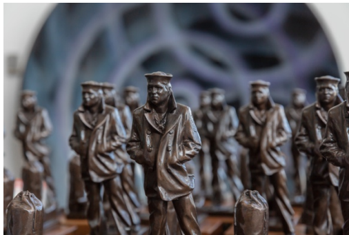
Miniature replicas of the Lone Sailor were presented to inaugural partners of the Foundation in 2021.

Another noteworthy achievement in the development realm was the successful completion of the Foundation's fundraising goal for the Lone Sailor statue. When USSCLF committed to partner with the U.S. Navy Memorial on this initiative to increase the visibility of the Sea Services in Northeast Ohio, the Board of Directors sought to raise $500,000.00. At the June 30, 2021, deadline for support, the Foundation had received commitments of $730,000.00 for the statue project. Donors of $25,000.00 or more received recognition in the form of miniature Lone Sailor statues at a breakfast reception prior to the statue's dedication on September 10, 2021, at Great Lakes Science Center.