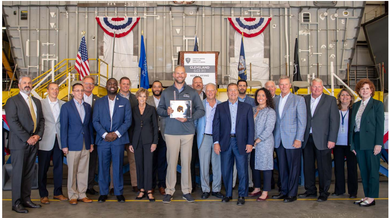
A group of USS Cleveland Legacy Foundation directors, donors, and community partners joined representatives of the United States Navy and Team Freedom – Lockheed Martin, Fincantieri Marinette Marine, and Gibbs and Cox – to celebrate the keel laying of CLEVELAND on June 16, 2021. A module of LCS 31 served as the backdrop for the ceremony.