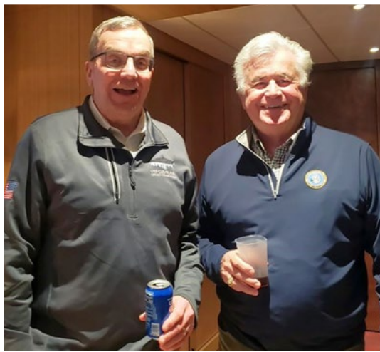
Cleveland Cavaliers Suite