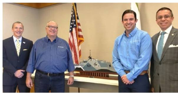
Ship Model Presentations