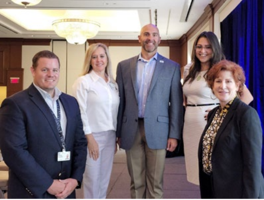
Medical Community Mixer