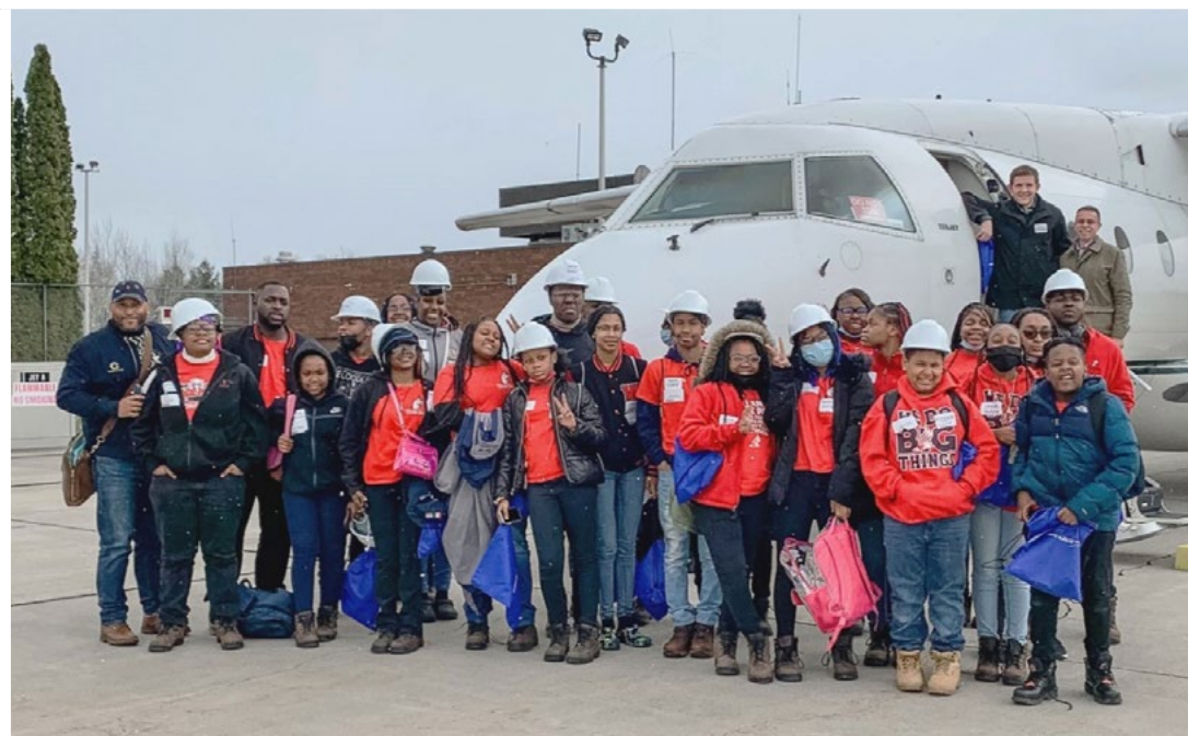
STEAM Stars Inaugural Cohort Trip to Marinette