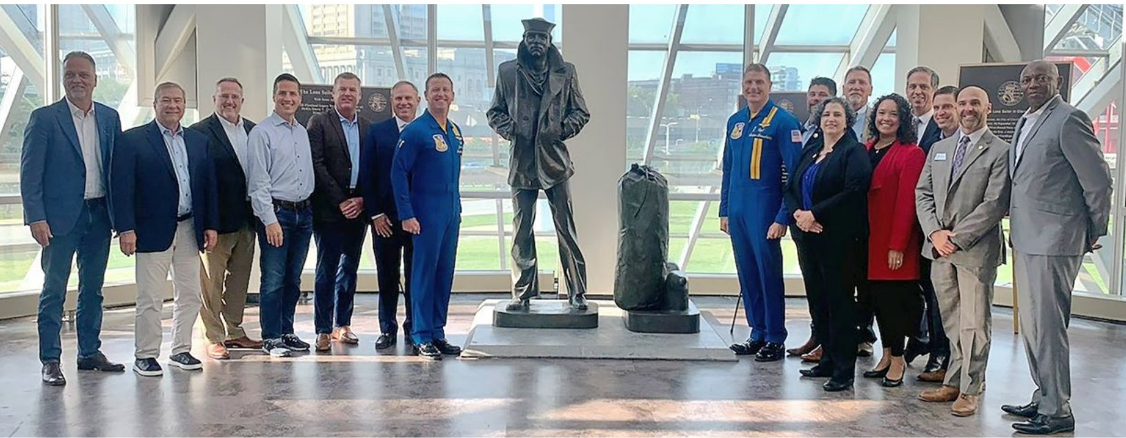
Blue Angels Leadership Breakfast during Cleveland National Air Show