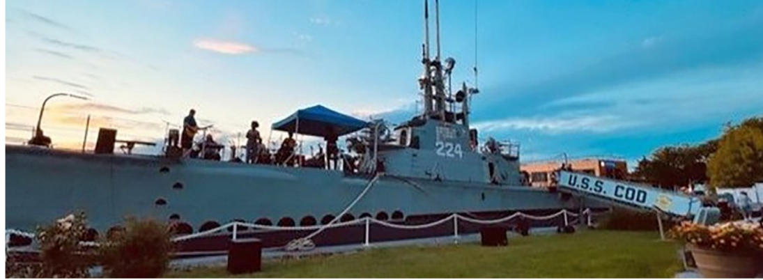
Cleveland National Air Show Veterans Cookout with Parker Hannifin