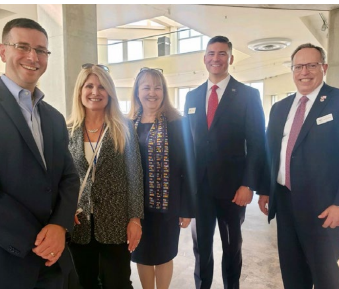
Greater Cleveland Attorneys Reception