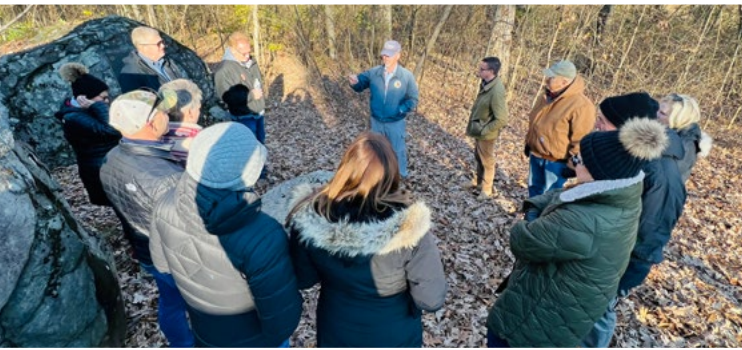
Gettysburg Battlefield Tour during Board Meeting