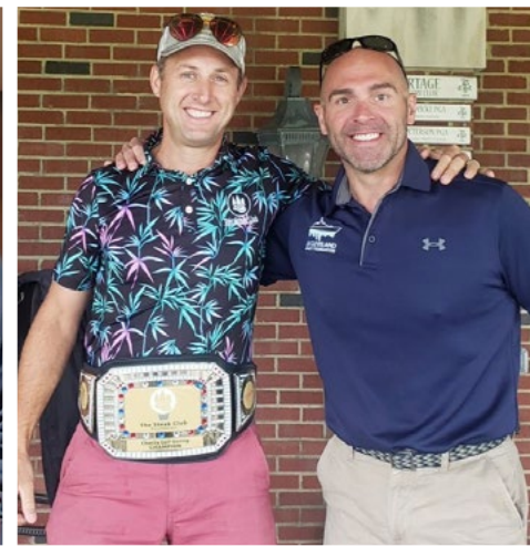
Steak Club Foundation Golf Outing Benefit