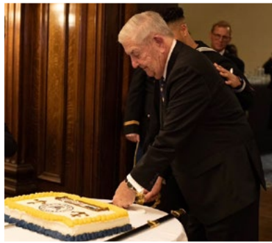
Inaugural Cleveland Navy Ball