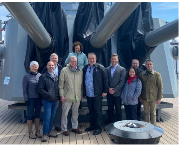
Annual Strategic Planning Retreat