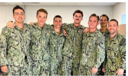
Initial Visit with Cleveland Crew in JAX