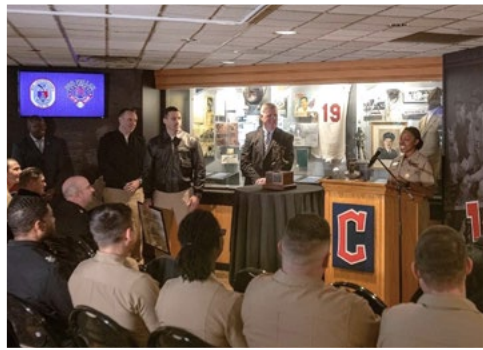
Cleveland Port Visit by PCU Cooperstown (LCS 23)