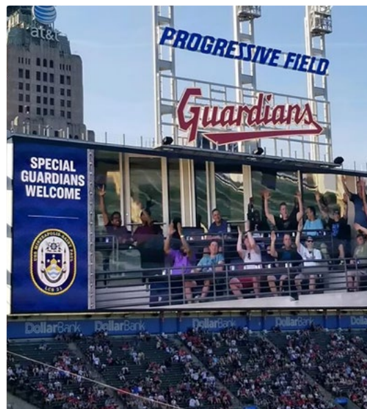
Cleveland Port Visit by MSP (LCS 21)