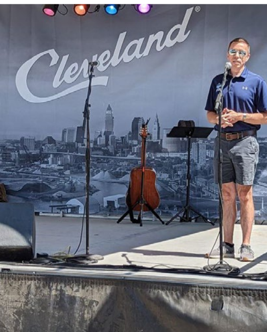
Cleveland Tall Ships Festival