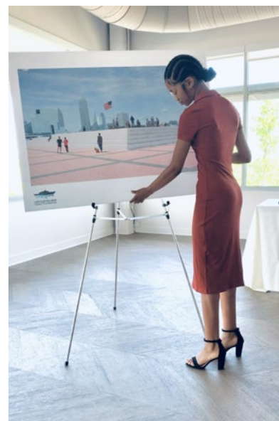
Cleveland Lone Sailor Monument Reveal